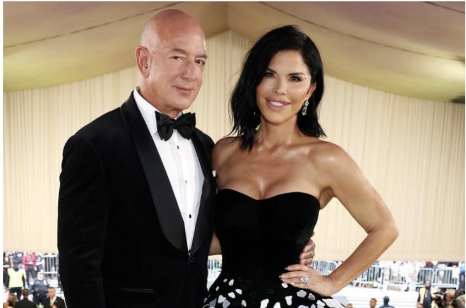
Jeff Bezos and Lauren Sanchez attend The 2024 Met Gala.