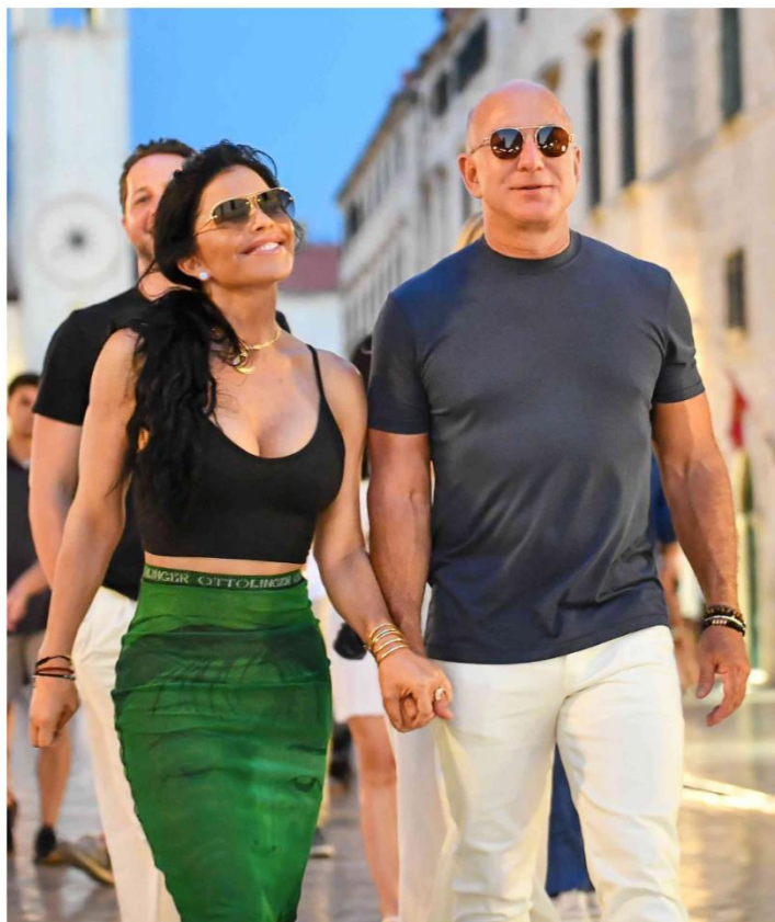
Jeff Bezos and Lauren Sanchez in Croatia in August 2024.

RELATED: Fallout Star Walton Goggins Says He Would Return to Justified Under 1 Condition (Exclusive)