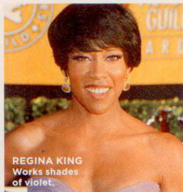
REGINA KING Works shades of violet.

Matching your handbag and shoes? Old-fashioned. Matching your eye makeup and dress? Fresh and modern. Don't mimic the exact shade, advises Fine: "Using a color in the same hue family is more interesting and dynamic."