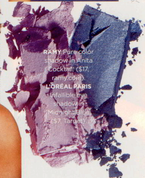
RAMY Pure color shadow in Anita Cocktail! ($17, ramy.com). L'ORÉAL PARIS Infallible eye shadow in Midnight Blue ($7, Target)

Before you get dressed, remove excess shimmer with a towel.