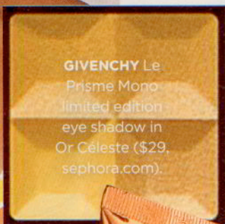
GIVENCHY Le Prisme Mono limited edition eye shadow in Or Céleste ($29, sephora.com)