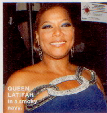
QUEEN LATIFAH In a smoky navy.