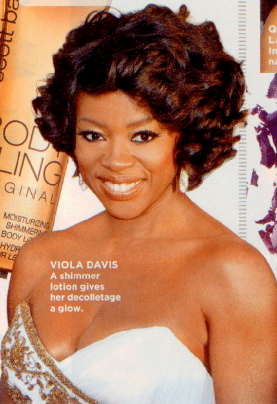
VIOLA DAVIS A shimmer lotion gives her décolletage a glow.