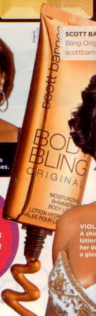
SCOTT BARNES Body Bling Original ($42, scottbarnes.com)